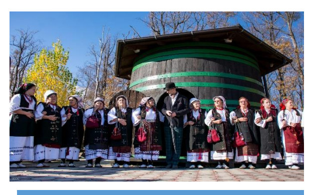
Promotion of Ganga

Project CODE contributed to the enhancement of business infrastructure and services to support innovations and cluster activities and improve start-up environment in cross-border area. Business support institutions (BSI) were supported to increase their impact on business environment through increasing quality of their service and creating supportive ambient within coworking spaces for enhancing start-up ecosystem. It enabled local BSIs to build their collaboration and created mentorship/coaching programme which helped start-ups to develop their projects. New service covered all stages of life cycle related to business incubation that is replicable in wider area. New business relationships and promotion of cross-border economic development were an added value within the project and opened further possibilities for joint drafting, implementation and financing of cross-border initiatives.