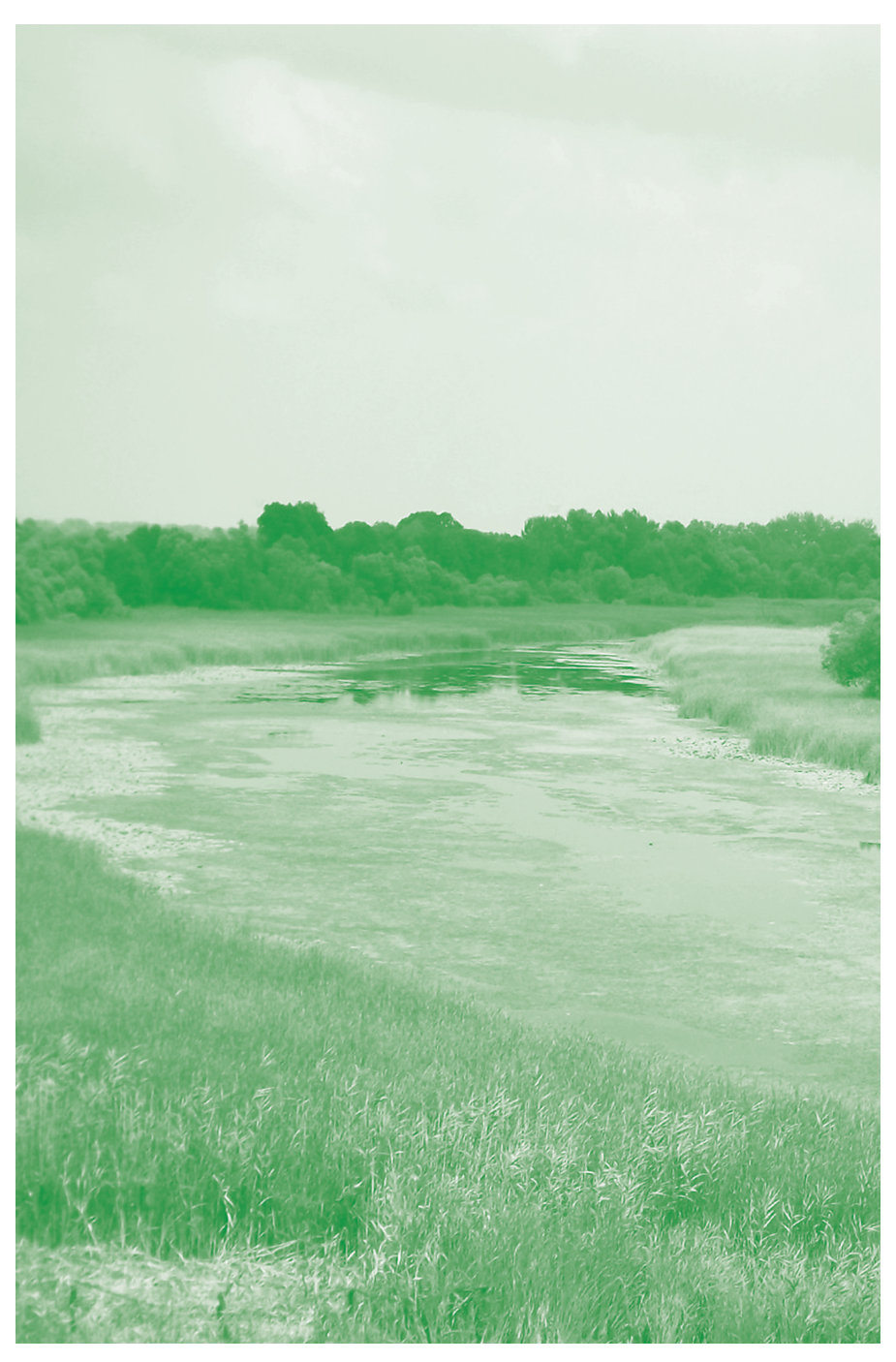
22 — Interreg IPA CBC Croatia – Bosnia and Herzegovina – Montenegro