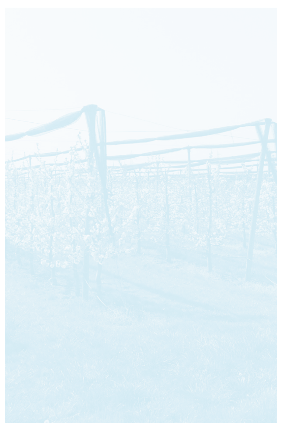
50 — Interreg IPA CBC Croatia – Bosnia and Herzegovina – Montenegro